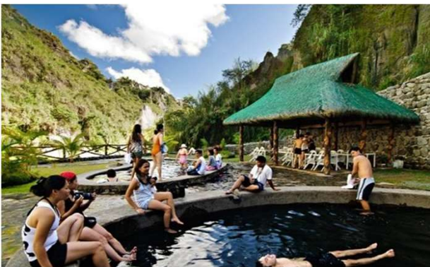
Puning Hot Spring